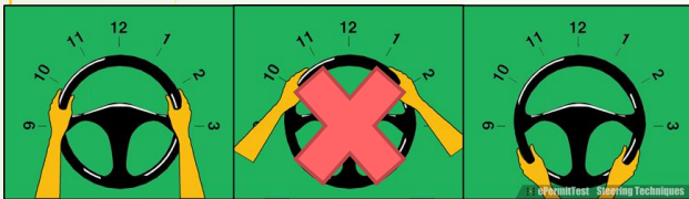
Get A Grip on the Right Way to Hold a Steering Wheel (AAA Video)